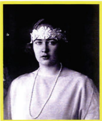
Принцеза Мариоара од Румуније - југословенска краљица Марија Princess Marioara of Romania - Yugoslavian Queen Maria