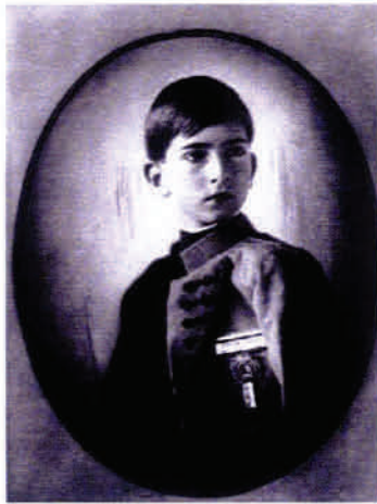
Краљ Петар II. King Peter II.

Philippe III le Bon (The Good) (1396-1467), Count of Charolais since 1404, Duke of Burgundy 1419-1467, Count of Flandres, Artois, Bourgogne and Bourgogne since 1419, Count of Namur since 1421, Duke of Brabant and Limburg since 1430, Count of Hennegau,