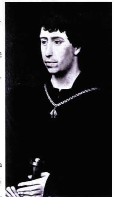
Бурзундски војвода Карло Смели. The Duke Charles le Téméraire of Burgundy.