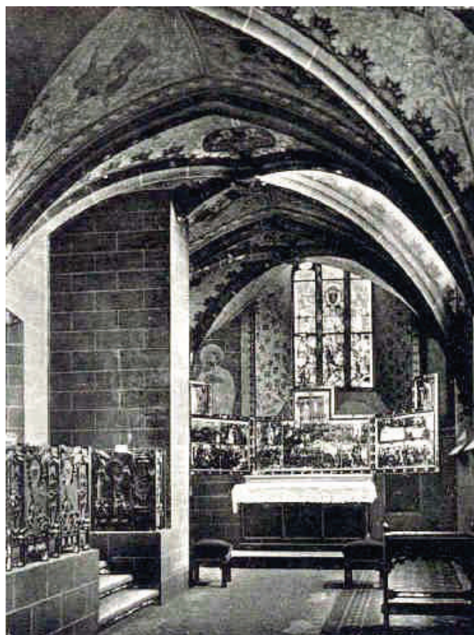
Доле: Улаз у Царску изборну капелу у Франкфурту. Десно: Изборна капела у којој су кнежевиектори гласали о кандидату за Немачког краља, што је био обавезујући корак за избор Светог римског цара. Below: Entrance to the Imperial Election Chapel in Frankfurt. Right: Election Chapel, where Princes Electors decided about the Candidates for the German King, which was first step to the election of the Holy Roman Emperor.