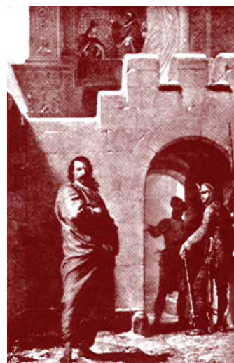
Цар Хајнрих IV босоног у снегу пред зидинама тврђаве у Каноси. Emperor Heinrich IV standing barefoot in snow in front of Canossa Fortress.