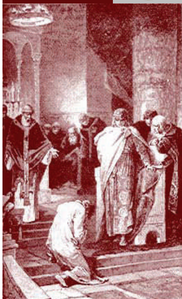
Отон Велики у Франкфуртској катедрали опрашта брату Хајнриху велеиздају. Otto I The Great pardons his brother Heinrich in the Dome of Frankfurt.