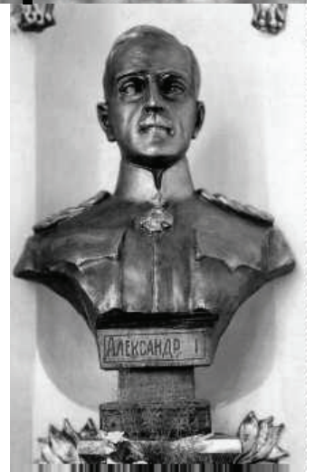
Сасвим горе: Краљев стег, према Закону од 1937. Горе: Биста краља Александра. Far above: King's Standard according to Law of 1937. Above: King Aleksandar I.