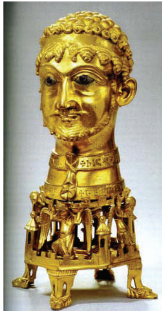
“Капенберика глава” од позлаћене бронзе из 1152. године, сматра се аутентичким портретом Фридриха Барбаросе. Данас је у музеју за уметност и историју у Салм-Капенбергу. “Cappenberg Head” made of gilded bronze in 1152 and exhibited in Museum fuer Kunst- und Kulturgeschichte in Salm-Cappenberg, is considered to be an authentic portrait of Emperor Friedrich I Barbarossa.